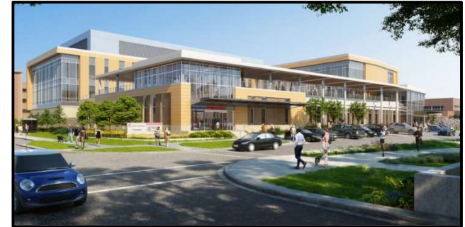
An architectural rendering of the UW School of Veterinary Medicine building expansion to be fully completed in 2024.

Department of Pathobiological Sciences School of Veterinary Medicine University of Wisconsin-Madison 2015 Linden Drive Madison, Wisconsin 53706 (608) 890-0479