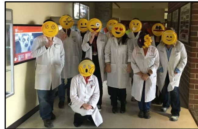
The emotive team of the UWVC Clinical Pathology Laboratory

The UWVC Clinical Pathology Laboratory performs analysis in hematology (Advia 2120), chemistry (Vitros 4600), coagulation (STA Compact Max and Haemonetics TEG), blood gas and point-of-care (ABL90), endocrinology and drug testing (Immulite 2000), cytology, urinalysis and parasitology, blood typing and cross matches, and other selected tests. The adjacent microbiology service for the hospital, led by a highly skilled and knowledgeable microbiologist, utilizes the most up-to-date methods for microbial identification (MALDI-TOF). The laboratory is staffed by a dedicated team of medical technologists supplemented by certified veterinary technicians, medical laboratory technicians, and other staff with an interest in laboratory procedures.