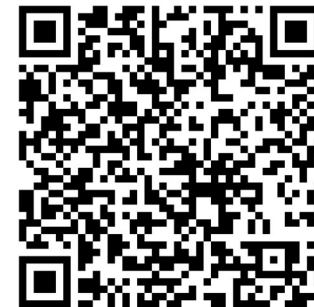
Scan to view our resident information